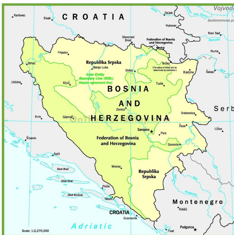
Figure 1- Bosnia and Herzegovina